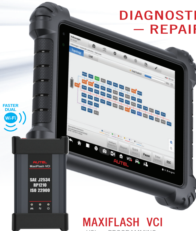
MAXIFLASH VCI VCI + PROGRAMMING