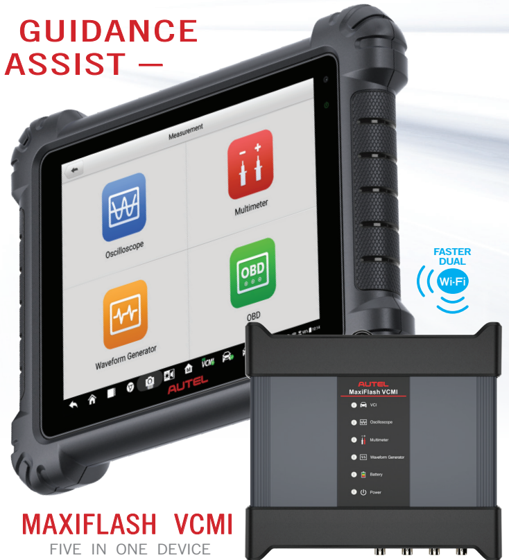
MAXIFLASH VCI FIVE IN ONE DEVICE